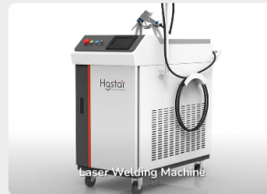
Laser Welding Machine