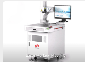
Laser Marking Machine