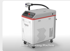
Laser Cleaning Machine