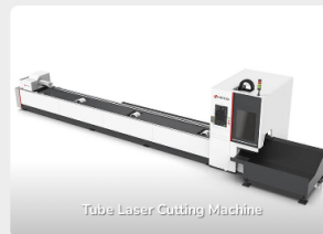
Tube Laser Cutting Machine